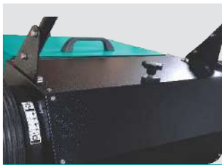
MAIN BRUSH ADJUSTMENT

The robust steel front dirt box maximum capacity of 40 litres.