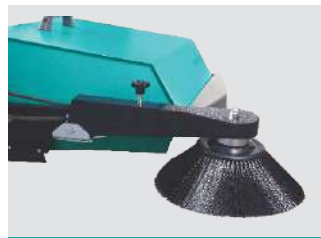
SIDE BRUSH ADJUSTMENT

The pressure of the main brush can be adjusted to achieve optimal sweeping results on any type of floor